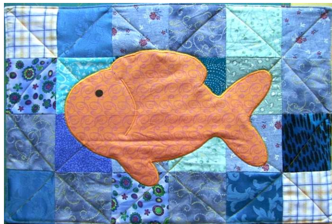
Go Fish! Kennel Quilt

Made by pattern tester Sylvia Dell'Aere 12" x 18"