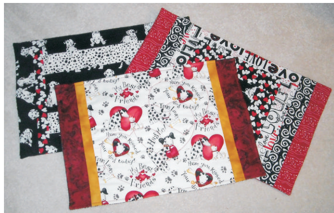
Orphan Block Kennel Quilt 12" x 18"